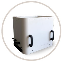
Stratasys H350 build removal box