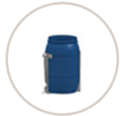
Stratasys H350 powder container